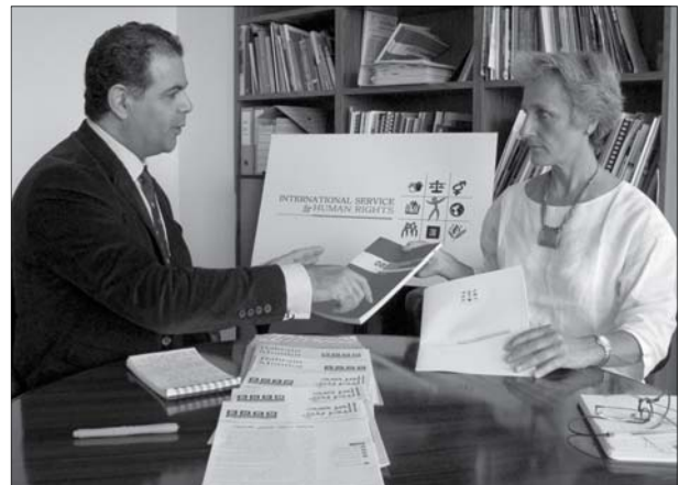
ISHR is planning to launch a new strategy for Middle East and well focus on empowering Arab human rights defenders

ISHR does not have a specific country agenda because it is essentially a service organisation that puts its expertise at the service of all human rights defenders in the world. ISHR played a major role in the process leading to the drafting of the UN Declaration on Human Rights Defenders in 1998 and in the creation of the mandate of the UN Special Rapporteur on Human Rights Defenders, and we have always continued to be very